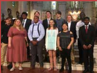
Last week's Baptism & Confirmation