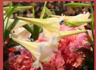
Easter Tribute Flowers