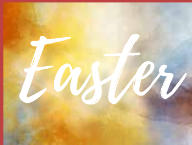
Holy Week and Easter