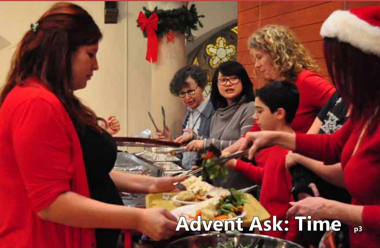
Advent Ask: Time p3