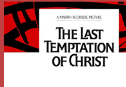
Young Adult Movie Night p6