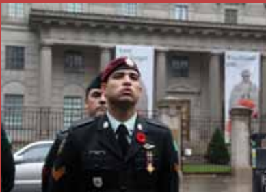
Remembrance Sunday p4