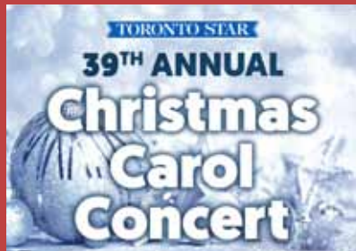
Star Concert Volunteers p5