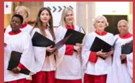
Singing in the Choir p7