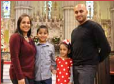
Christmas at St. Paul's p4