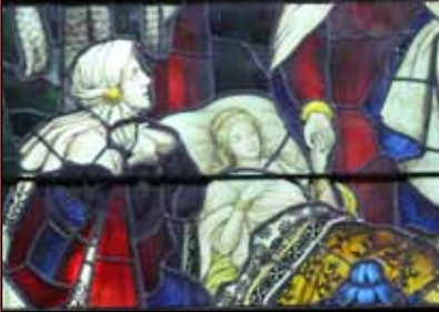
Current Sermon Series p2