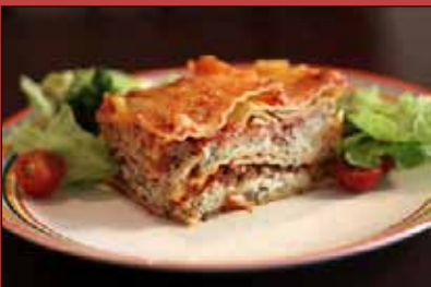
Community Lunch p4