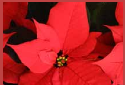
p6 Christmas Tribute Flowers p7