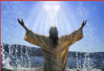
Baptism: The Call to a Full Life p5-6