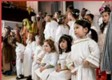
The Pageant is Coming!