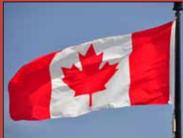
Happy Canada Day!