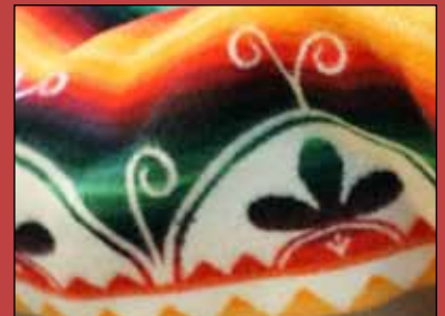
Aboriginal Day of Prayer p3