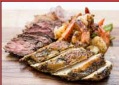
Rentals & Catering p4