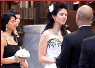
The Marriage Course p2