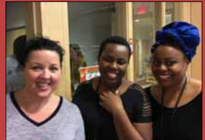
Cornerstone Photos p5